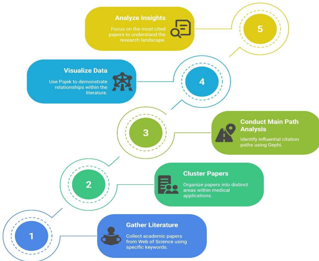
Figure 1: Overview of the Citation Network Analysis (CNA) steps used in this study.

To gather the literature for this review, we used CNA by sourcing academic papers from the Web of Science (WOS). The search used the keywords: "brain image" OR "automatic segmentation" AND "artificial intelligence" OR "machine learning" AND "public health" AND "disease prediction", streamlining the selection to papers focused on brain imaging. We built the citation network using Search Path Link Count (SPLC), which measures how often a connection appears across search paths to highlight influential knowledge flows between papers. The global main path was then derived by linking the highest-weighted connections from seminal to recent studies and visualized using Gephi. An overview of the CNA process is shown in Figure 1.